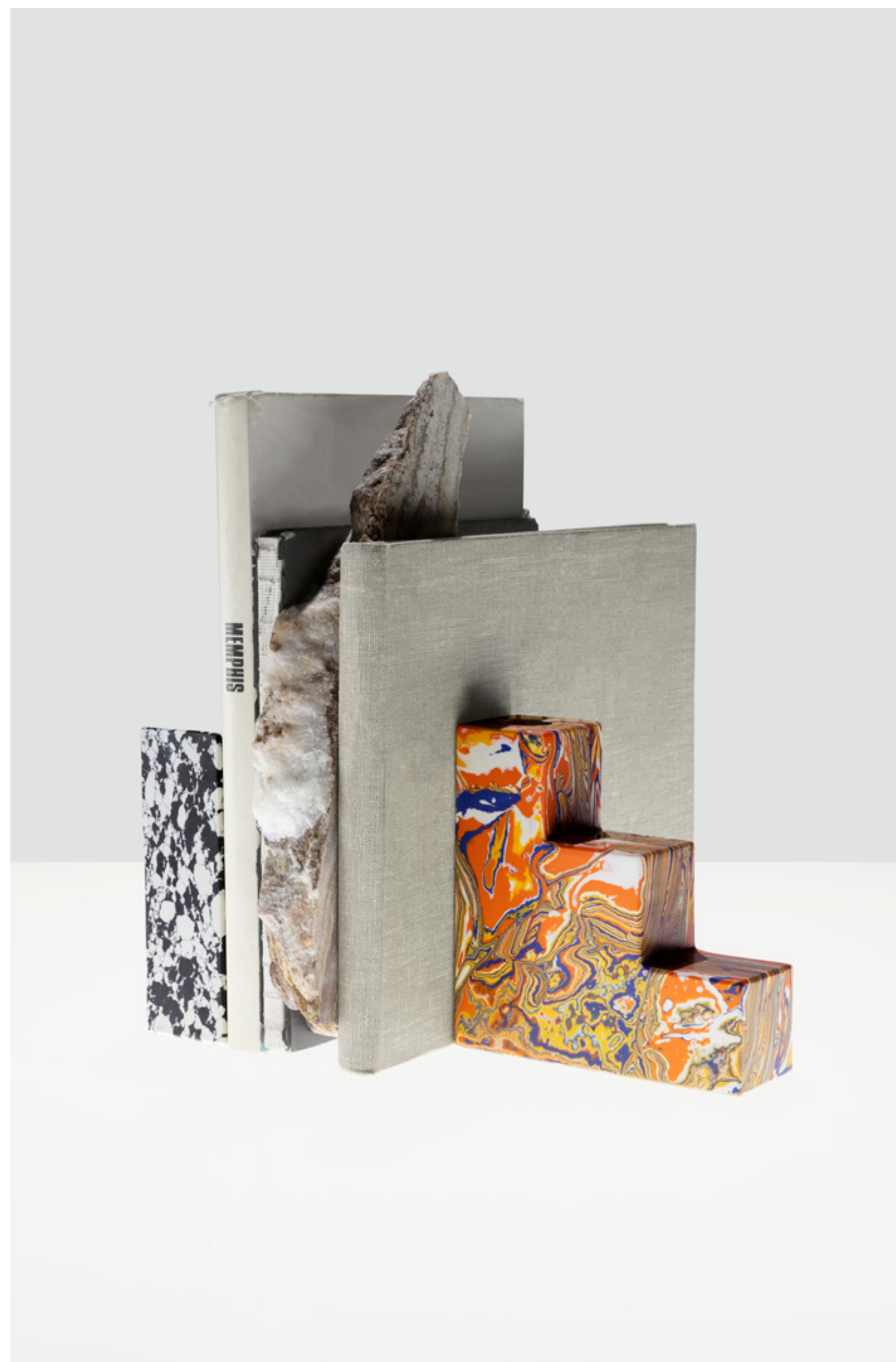
SWIRL STEPPED BOOK ENDS OPPOSITE: SWIRL CONE CANDLE HOLDER, SWIRL DUMBBELL CANDLE HOLDER AND SWIRL STEPPED CANDLE HOLDER

SWIRL is a series of geometric forms stacked upon one another to create multi-dimensional, functional sculptures. A family of candleholders, bookends and vases, each with their own distinct silhouette, colouration and personality. The unique process involves recycling the powdered residue from the marble industry, mixed with pigment and resin to create blocks of material that can then be sawn, sliced and turned on a lathe. Substantial in weight, smooth in texture and bold in pattern, SWIRL will inject a fresh pop sensibility into any setting.