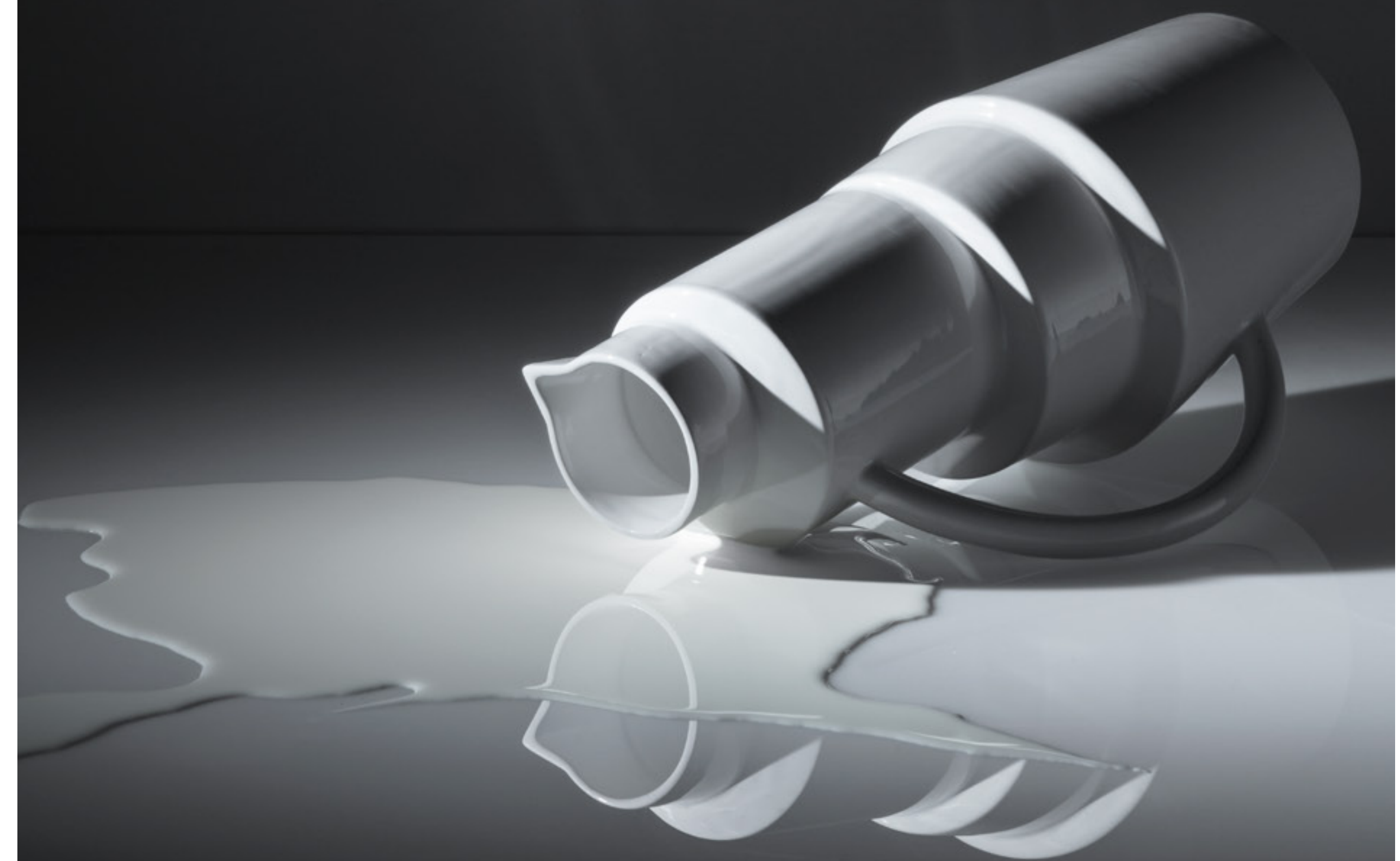
BLOCK VASES, BOWL AND JUG

Architecturally geometric and highly sculptural, BLOCK is a series of decorative and functional ceramics. Cubic and cylindrical forms are stacked upon each other to create irregular cubist designs to adorn your living spaces. Produced in Portugal, a country that is renowned for its expertise in ceramics, the BLOCK family is slip cast to create a sense of uniformity. The high gloss hand-glaze process adds individuality to each piece.