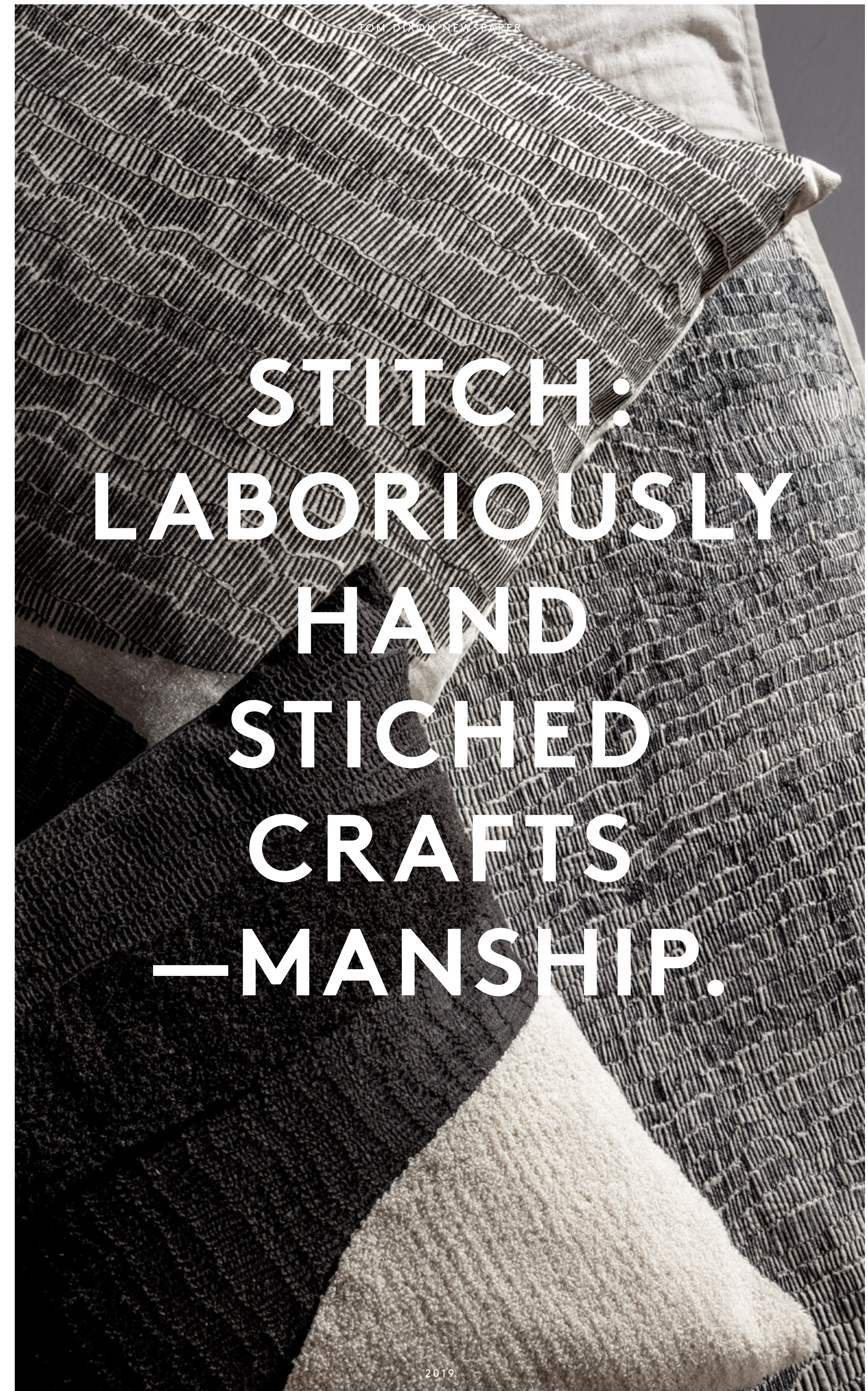
STITCH THROW AND STITCH CUSHIONS

STITCH depicts defined monochromatic forms, which have been created through meticulous hand-embroidered techniques. The curvature of the shapes and free-flowing nature of the lines and stitch work produce a minimal aesthetic. The design is a process of reduction; by subtracting detail and simplifying form, the design becomes highly abstract.