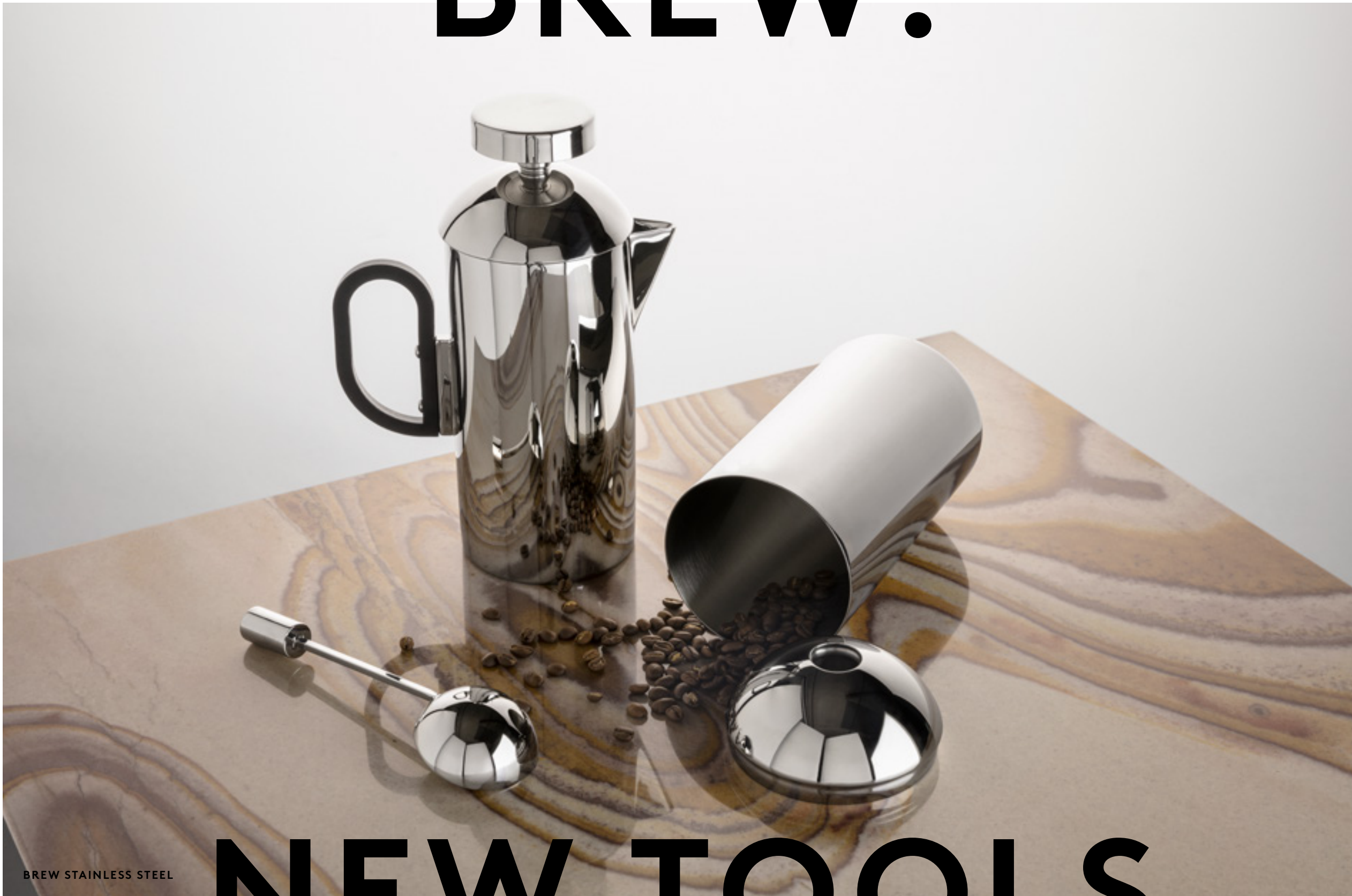
BREW STAINLESS STEEL

BREW recognises the artistry of coffee making and coffee drinking as one of our few remaining contemporary rituals. Precision engineered from stainless steel with a polished finish, Brew is hyper reflective, functionally rigorous and designed to take pride of place on any kitchen counter, bar or occasional table.