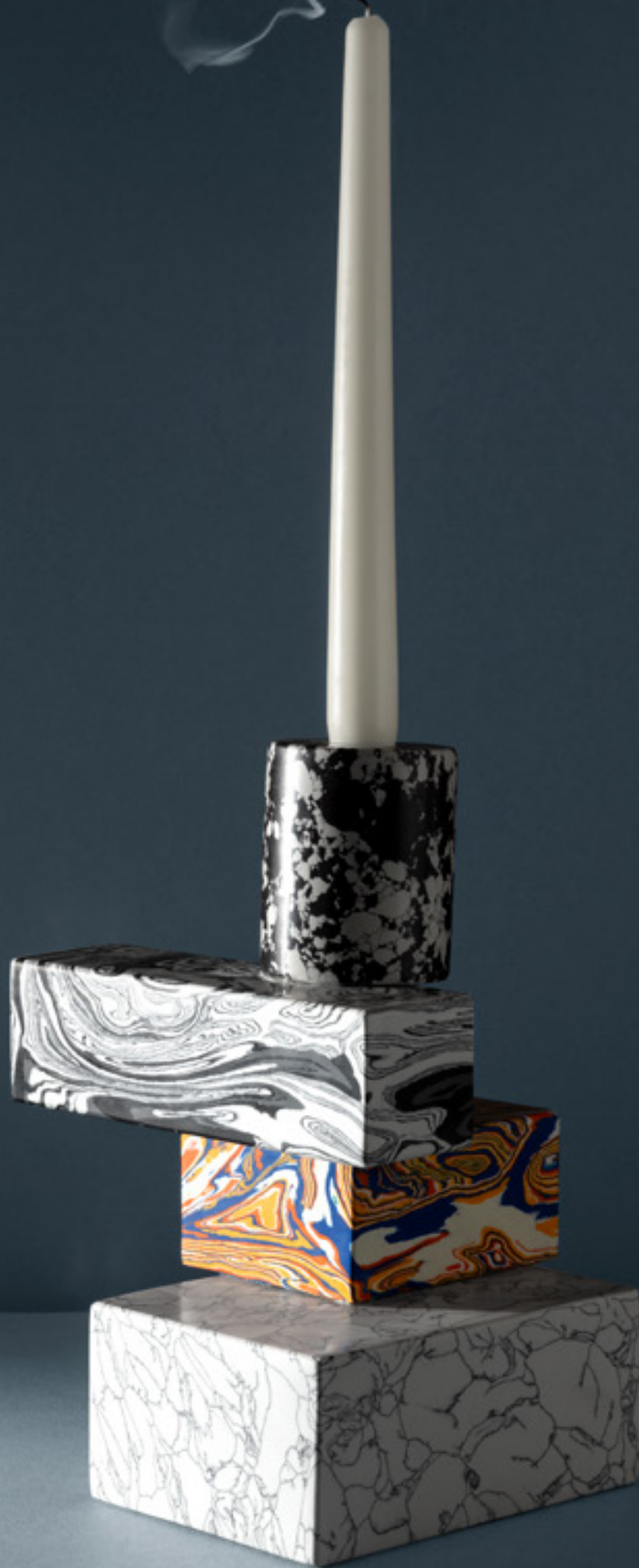
SWIRL MULTI CANDELABRA