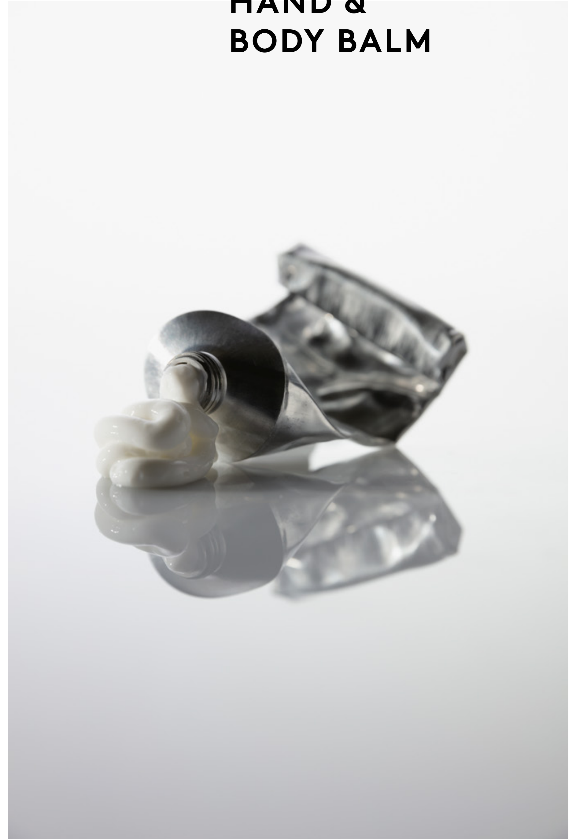
ECLECTIC HAND BALM OPPOSITE: ECLECTIC BODY WASHES 500ML

Available in our three signature Eclectic scents, the new hand balm is offered in a 75ml tube and the new body balm in a 150ml tube.